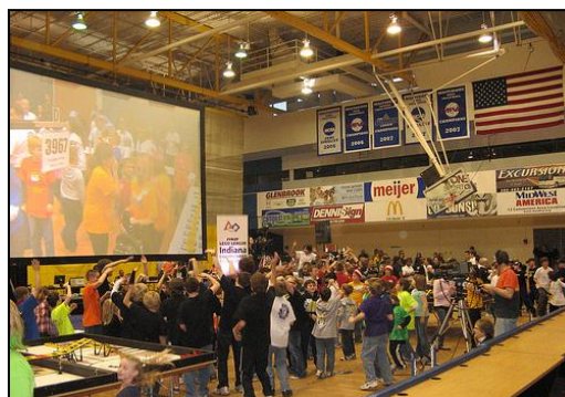
Above: All State Qualifying teams dancing while judges tally scores.

You and any other representatives of your company will be most welcome to attend so that we can thank you personally for your support.