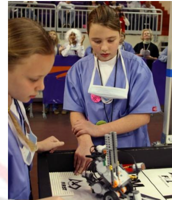
Above: Two students run their robot during a Robot Performance Round.

“Everyone seems to know that one needs a solid background in mathematics and the physical sciences in order to be an engineer. Professional engineers draw upon this knowledge every day in their professional life as they set out to design, create, invent, innovate and solve problems. Yet, there is an important piece of what could be considered "pre-engineering" missing from the public's consciousness, and that is to have students that aspire to be engineers study technology during their K-12 education.” 1 FIRST (For Inspiration and Recognition of Science and Technology) has set out to change this!