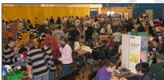
Above: Side view of the action in the pit area.

You and any other representatives of your company will be most welcome to attend so that we can thank you personally for your support.